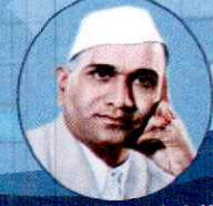
Karmaveer Bhausaheb Hiray